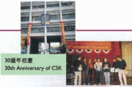
30週年校慶 30th Anniversary of CSK

1997 星島辯論比賽—冠軍 Inter-school Chinese Debate Competition – CHAMPION