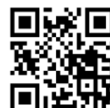
'Developing a Growth Mindset' with Carol Dweck