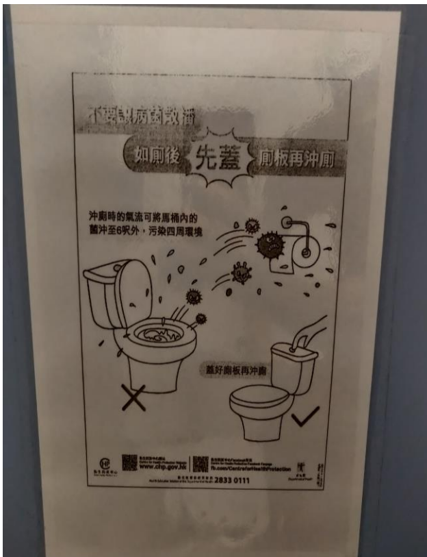
xi. Signage to remind students to close toilet lids when flushing