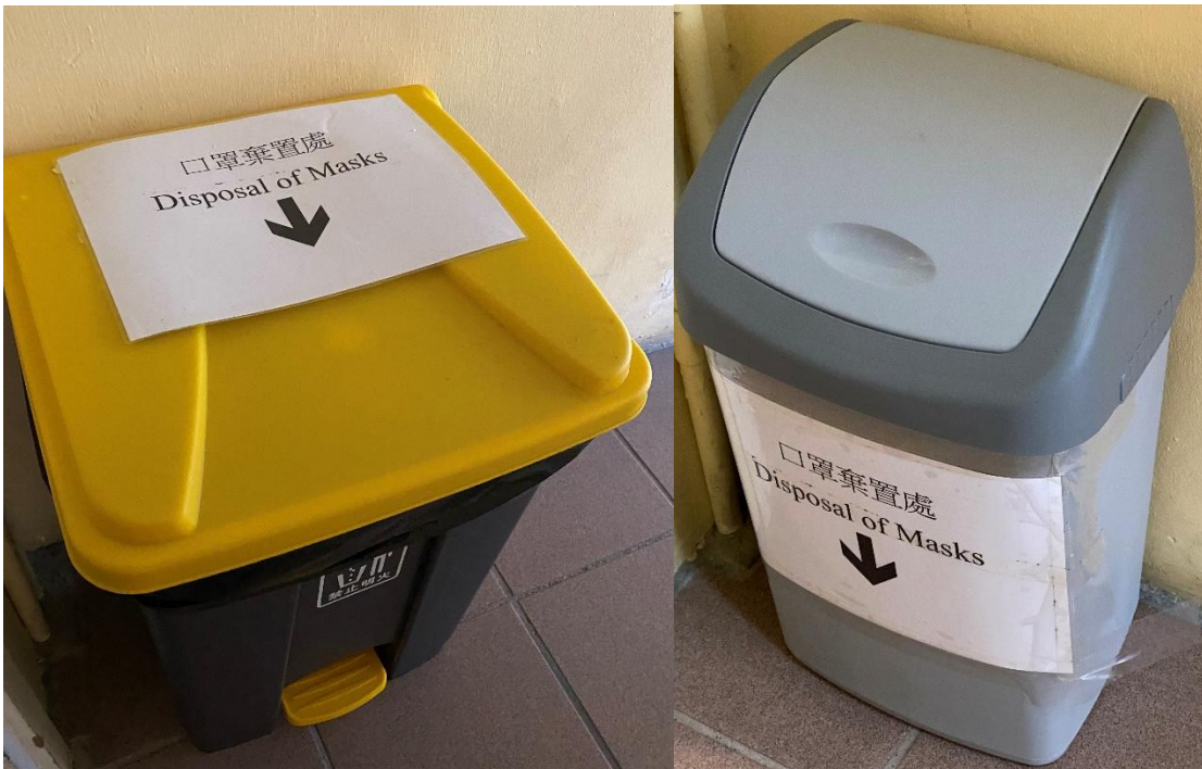
viii. lidded rubbish bin on each floor