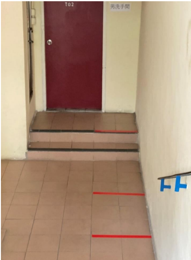
ix. floor markings for toilet queue management