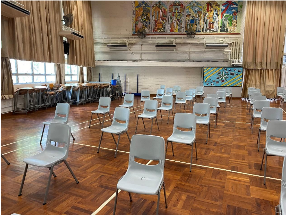
v. special seating arrangement in the school hall