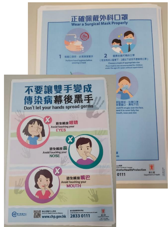
xii. Various health education materials displayed on campus