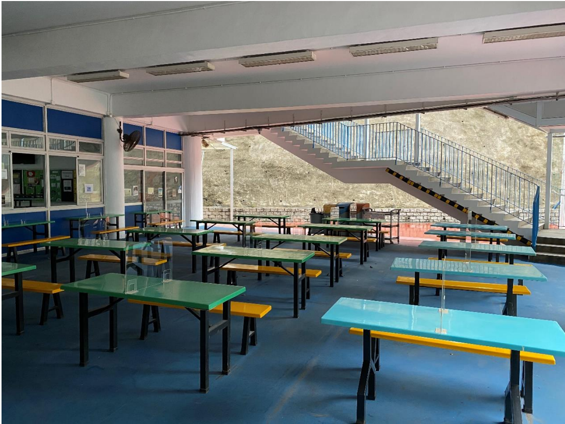
vii. special seating arrangement and partitioned tables in the canteen