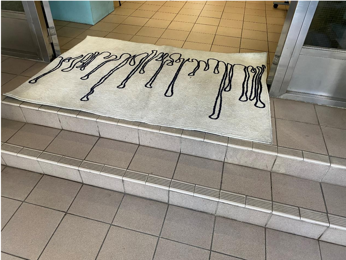
iii. a sterilized carpet at the school entrance