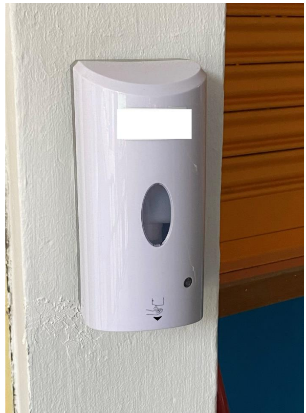
x. automatic hand sanitizer dispenser